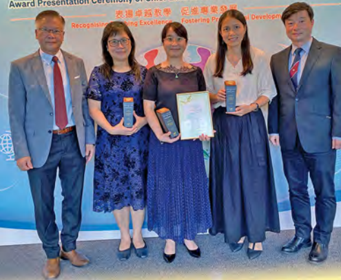
2018-2019 行政長官卓越教學獎嘉許狀 (英國語文教育學習領域)

行政長官卓越教學獎頒獎典禮 Award Presentation Ceremony of Chief Executive's Award for Teaching Excellence