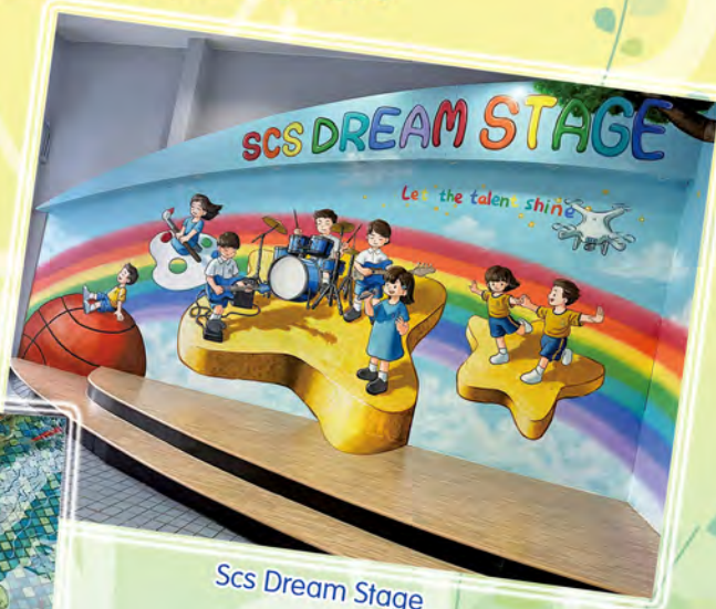
Scs Dream Stage