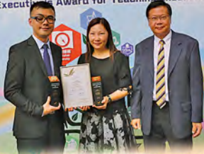
2015-2016 行政長官卓越教學獎嘉許狀 (數學教育學習領域)

2015 / 2016 行政長官卓越教學獎頒獎典禮 Award Presentation Ceremony of Chief Executive's Award for Teaching Excellence