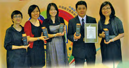
2009-2010 行政長官卓越教學獎嘉許狀 (中國語文教育學習領域)

2009 / 2010 行政長官卓越教學獎頒獎典禮 AWARD PRESENTATION CEREMONY OF CHIEF EXECUTIVE'S AWARD FOR TEACHING EXCELLENCE