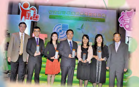
2011-2012 行政長官卓越教學獎 (資訊科技教育)

2009 / 2010 行政長官卓越教學獎頒獎典禮 AWARD PRESENTATION CEREMONY OF CHIEF EXECUTIVE'S AWARD FOR TEACHING EXCELLENCE