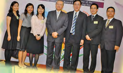
2008-2009 行政長官卓越教學獎嘉許狀 (科技教育學習領域)

2008-2009 行政長官卓越教學獎頒獎典禮 Award Presentation Ceremony of Chief Executive's Award for Teaching Excellence